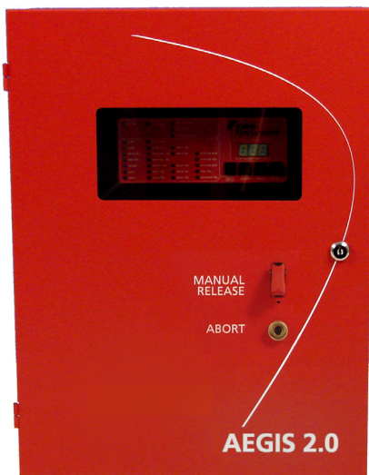
AEGIS 2.0 Control Unit with Switches